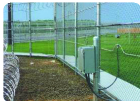
Perimeter Fencing/Intrusion Detection Systems